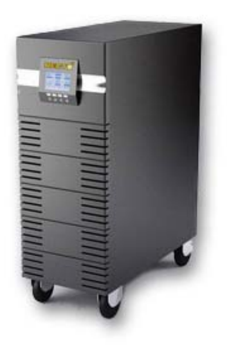
FIGURE 1. Left, ATS-1000E-30A (19" rackmountable, height: 2U, and weight is about 7 kg) FIGURE 2. Right, 10 kVA online UPS system (typical standalone cabinet, weight is about 150 kg with a 8–10 minutes battery bank)