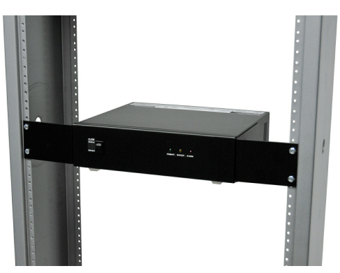
ATS-500 shown mounted to 19" rack with MK-4019A front mounting brackets

TSi Power's indoor products can be mounted on standard 19", 23" and 24" racks or on the wall or on the floor.