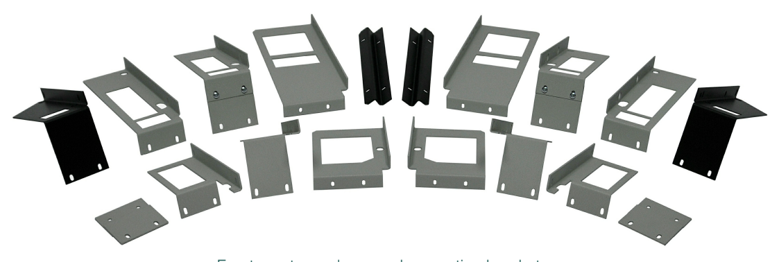
Front, center and rear rack-mounting brackets for 19", 23" and 24" racks, as well as wall and floor mounting brackets