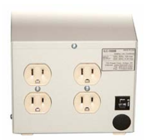
rear view ILc-1000B shown without 6' line cord/plug