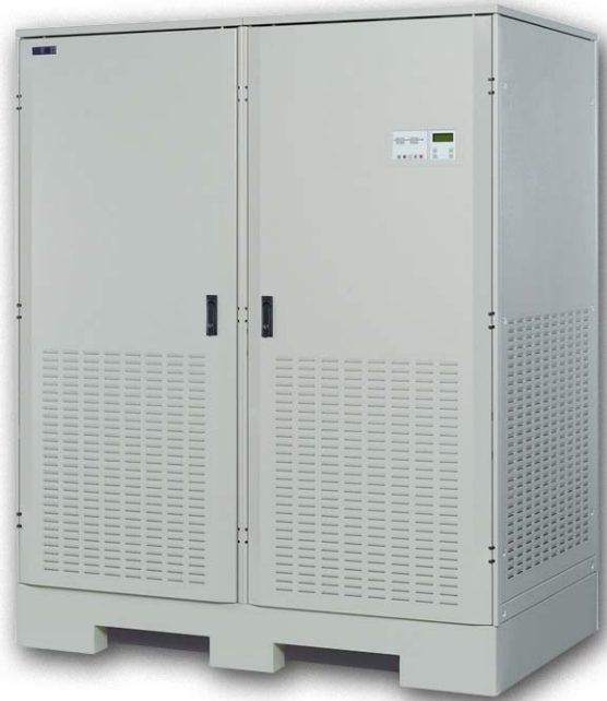
FIGURE 1. Left, TSi Power's 45 kW 3-phase VRP (size of a small file cabinet, and weight is about 150 kg)