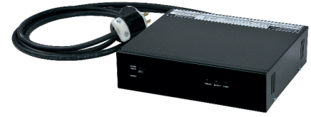
Front view showing enable/disable audible alarm switch and LED status indicators

The ATS-500 automatic transfer switch is designed for multiple autonomous power sources. The ATS can be utilized as single or multiple units for different levels of redundancy.