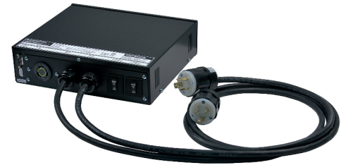
Rear view showing input plugs, output cable port, DB-9 connector, primary and backup circuit breakers

Applications include but are not limited to telecom, data centers, industrial control, automatic test equipment, oil & gas and utilities.